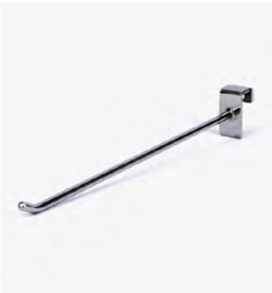
PRONG HOOK – 250MM