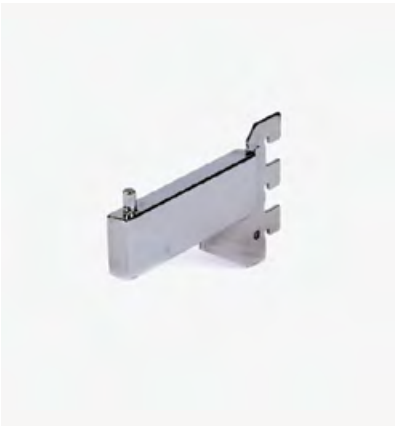
DISPLAY ARM – 100MM