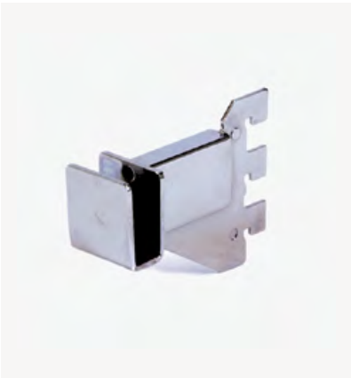
CROSS BAR SUPPORT ARM – 50MM