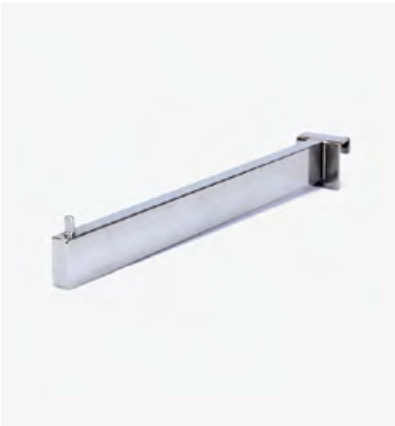
FRONT HANG ARM TO SUIT CROSS BAR – 300MM