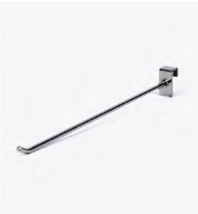
PRONG HOOK – 300MM