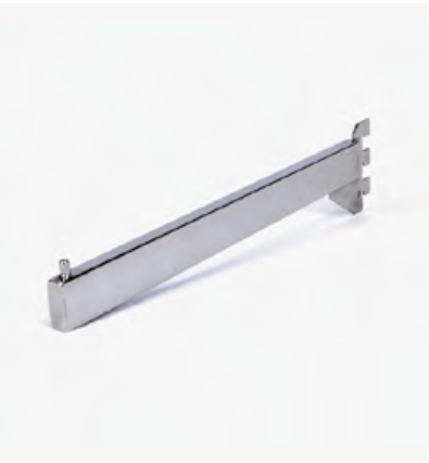
FRONT HANG ARM TO SUIT STRIPPING – 350MM